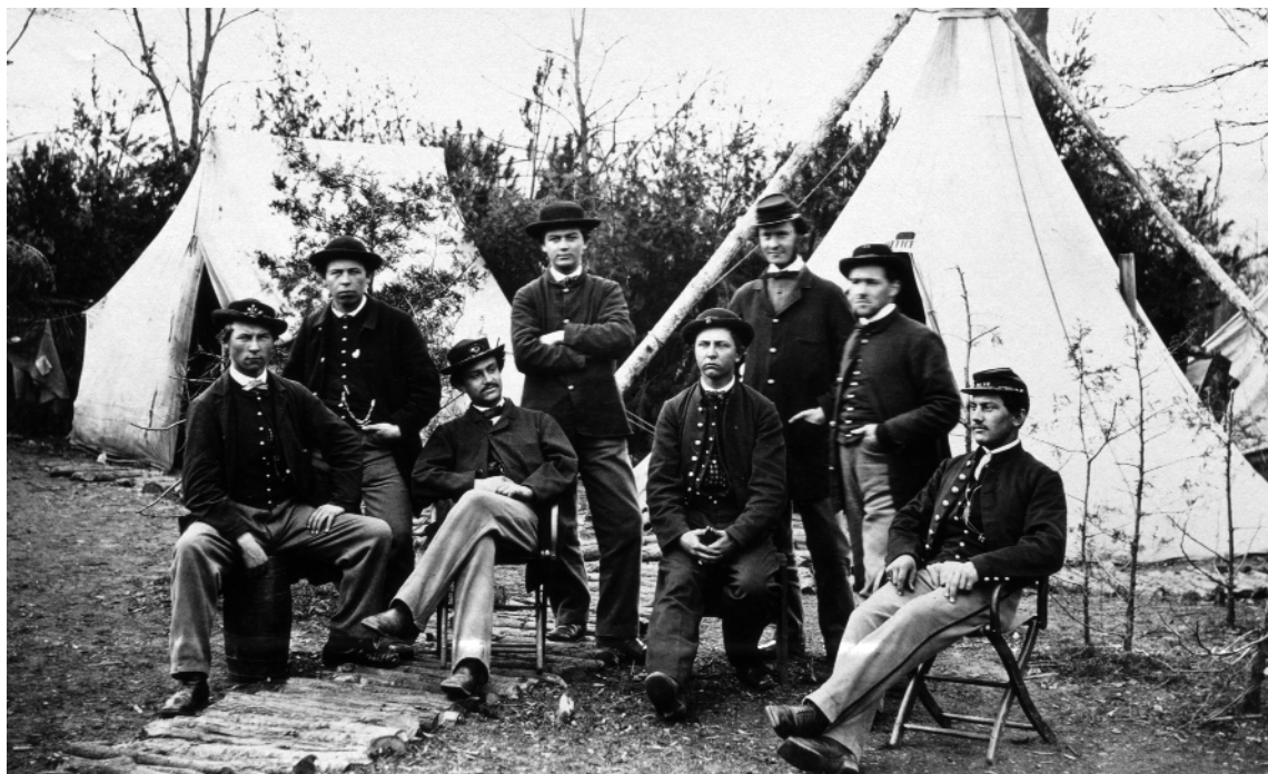
Nearly three million men served in the Civil War. More than two million were Union soldiers like those shown at this Civil War encampment.

The novel’s style is impressionistic, reflecting this subjective approach. Impressionism , a term borrowed from the fine arts, refers to a highly personal way of seeing. Like an impressionist painter, the impressionist writer does not present objects